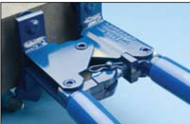
Fig. 9 If the mold does not seal properly, make adjustments to tighten/loosen the handle clamp.