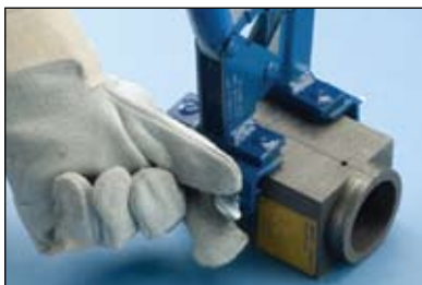
Fig. 7 Tighten the clamp thumbscrews onto the mold.