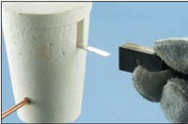
Fig. 12 Place the ignition strip into the control unit connector. Remove or protect fire hazards in close proximity to the connection. Advise nearby personnel of welding operations in the area.