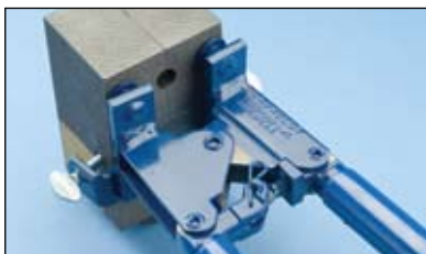
Fig. 8 Close the grips to tightly lock the mold. Check for an appropriate seal on the mold.