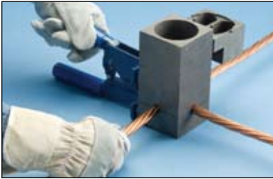
Fig. 13 Insert the conductors and position them for the connection.