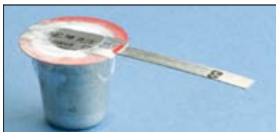
Fig. 8 Inspect the cup to ensure it is tightly sealed and the ignition strip is securely attached to the seal.