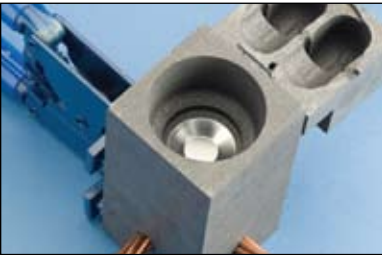
Fig. 17 Ensure that the steel disk is properly seated.