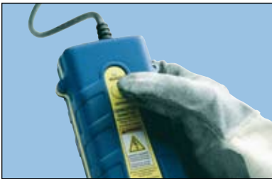
Fig. 13 Using the control unit, press the button and hold, while you observe the "ready" indicator light. A green light will blink for a few seconds and then will change to a constant light. At this time, the unit will send a charge to the ignition strip. The ignition strip will spark inside the metal cup, activating the CADWELD® PLUS exothermic reaction.

Allow approximately 30 seconds for completion of the reaction and solidification of the molten material.