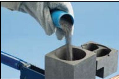
Fig. 20 Quickly pour the loose welding material powder into the mold.