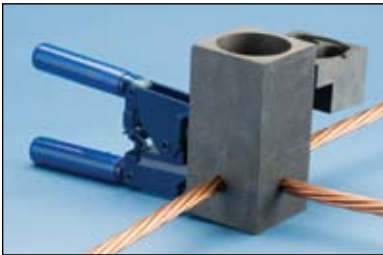
Fig. 14 Close the clamp tightly once the conductors are properly positioned.