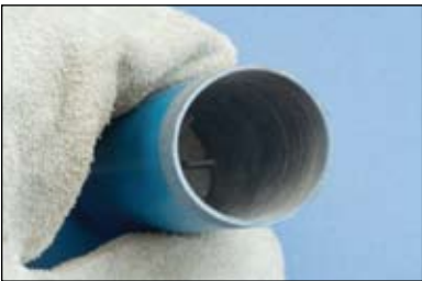
Fig. 21 The bottom of the tube contains compressed material (starting material). Tap the bottom of the tube a couple of times to loosen this material.