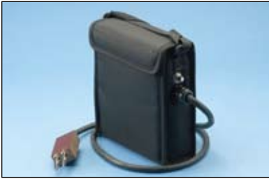
Fig. 24 CADWELD® EXOLON battery pack.