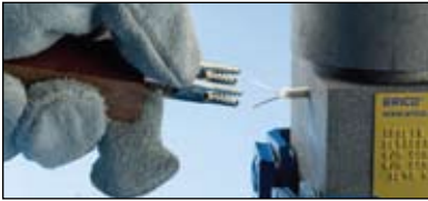
Fig. 25 Take the alligator clips and clip them onto the wire leads. Remove or protect fire hazards in close proximity to the connection. Advise nearby personnel of welding operations in the area.