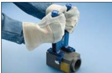
Fig. 9 If the mold does not seal properly, make adjustments to the handle clamp.