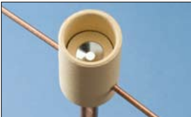
Fig. 9 Ensure that the steel disk is properly seated inside the CADWELD ONE SHOT.