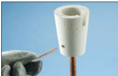
Fig. 7 Insert the conductors and position them for the connection.