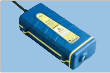
Fig. 11 Battery powered control unit.