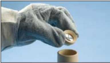
Fig. 8 Place the steel disk into the CADWELD® ONE SHOT with the concave side facing up.