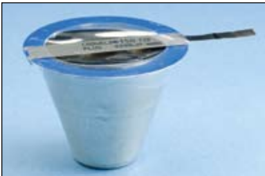
Fig. 15 Remove the proper CADWELD® PLUS welding material cup from the plastic container. Inspect the cup to ensure it is tightly sealed and the ignition strip is securely attached to the seal.