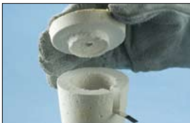
Fig. 10 Place the ceramic lid onto the mold.