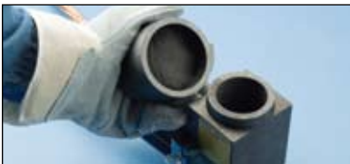
Fig. 27 Remove the alligator clips from the igniter pin. Remove the graphite cover of the CADWELD EXOLON mold.