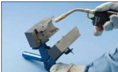
Fig. 10 Graphite absorbs moisture. Ignite the propane torch and dry out the inside of the mold thoroughly on both sides, heating the mold to approximately 250 degrees Fahrenheit (120 degrees Celsius).