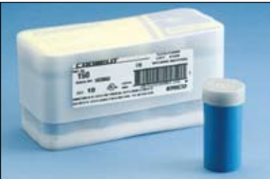
Fig. 18 Next, take a tube of properly sized welding material (as identified on the mold ID tag) out of the box.