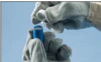
Fig. 10 Next, take the tube of welding material included in the CADWELD ONE SHOT package and remove the lid over the crucible.