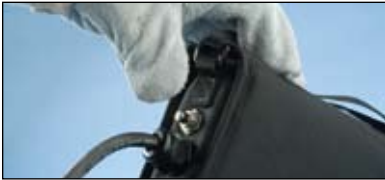
Fig. 26 Using the CADWELD EXOLON battery pack, press the button. At this time, the unit will send a charge to the igniter pin. The igniter pin will initiate the CADWELD EXOLON exothermic reaction. Allow approximately 30 seconds for completion of the reaction and solidification of the molten material.