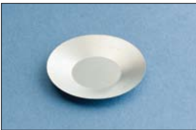
Fig. 15 Steel disk found inside the packaging box of welding material.