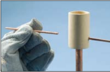
Fig. 7 Insert the conductors and position them for the connection.