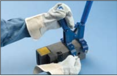
Fig. 7 Tighten the clamp thumbscrews onto the mold.