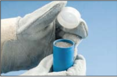
Fig. 19 Remove the lid over the mold crucible.