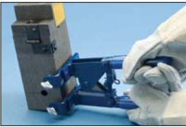
Fig. 8 Close the grips to tightly lock the mold. Check for an appropriate seal on the mold.