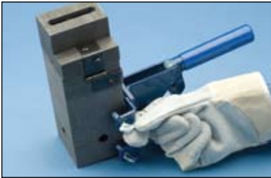
Fig. 7 Tighten the clamp thumbscrews onto the mold.