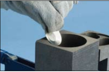
Fig. 16 Insert the steel disk (concave side up) into the mold. Hold the steel disk on the side of the mold and let it slide into place.