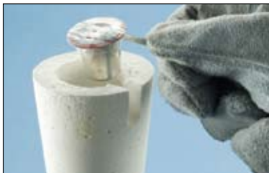
Fig. 9 Place the welding material cup into the top of the mold. Make sure the ignition strip nests into the recess on the top edge.