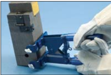
Fig. 8 Close the grips to tightly lock the mold. Check for an appropriate seal on the mold.