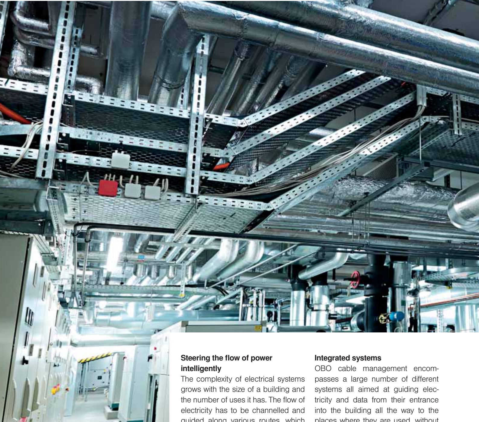
Cable tray system