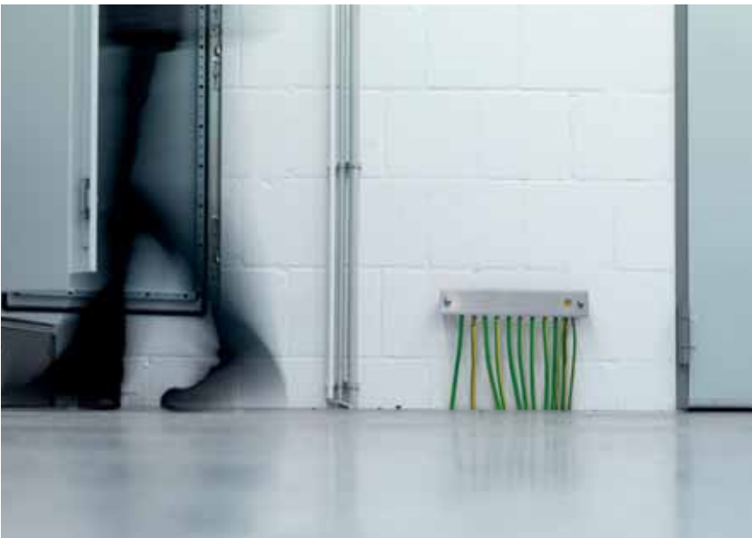
Top: equipotential bonding rail Bottom: interception rod

OBO systems protect people and property reliably. Air termination systems, conductors and earthing systems provide external lightning protection, while equipotential bonding and surge protection equipment protects against the effects of lightning current. Only if all these components are installed is genuine protection afforded. OBO supplies all of these elements, perfectly matched and from a single source.