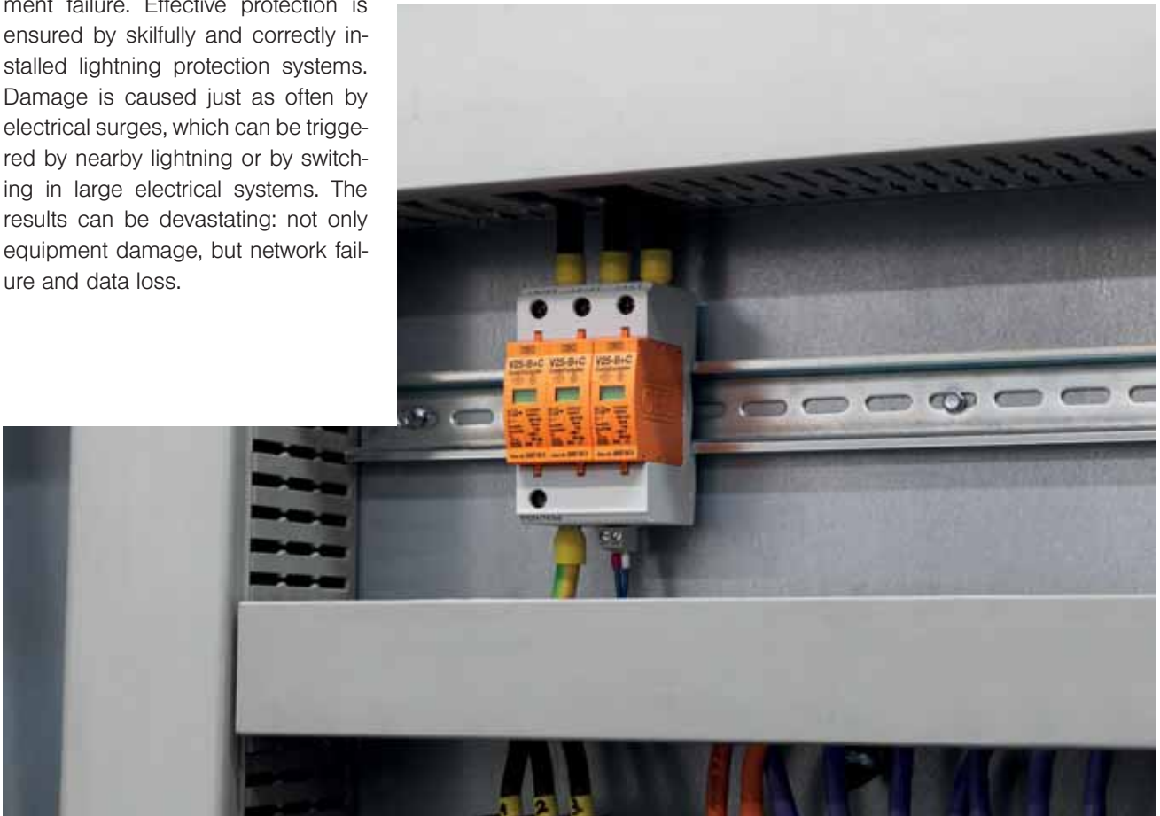
Top: combination conductor in a switchgear cabinet with Dahl wiring ducts

No hospital operator can afford a lightning-induced technical equipment failure. Effective protection is ensured by skilfully and correctly installed lightning protection systems. Damage is caused just as often by electrical surges, which can be triggered by nearby lightning or by switching in large electrical systems. The results can be devastating: not only equipment damage, but network failure and data loss.