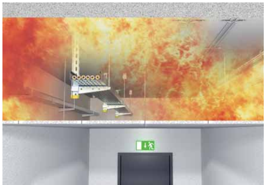
Escape route installation system above a suspended fire protection ceiling