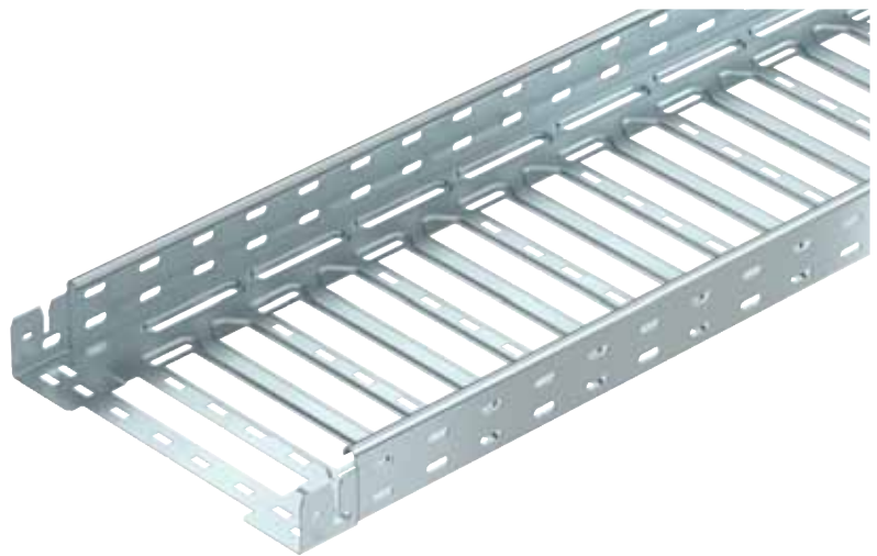
Centre right: RKS-Magic® cable tray system Bottom: MKS-Magic® cable tray system