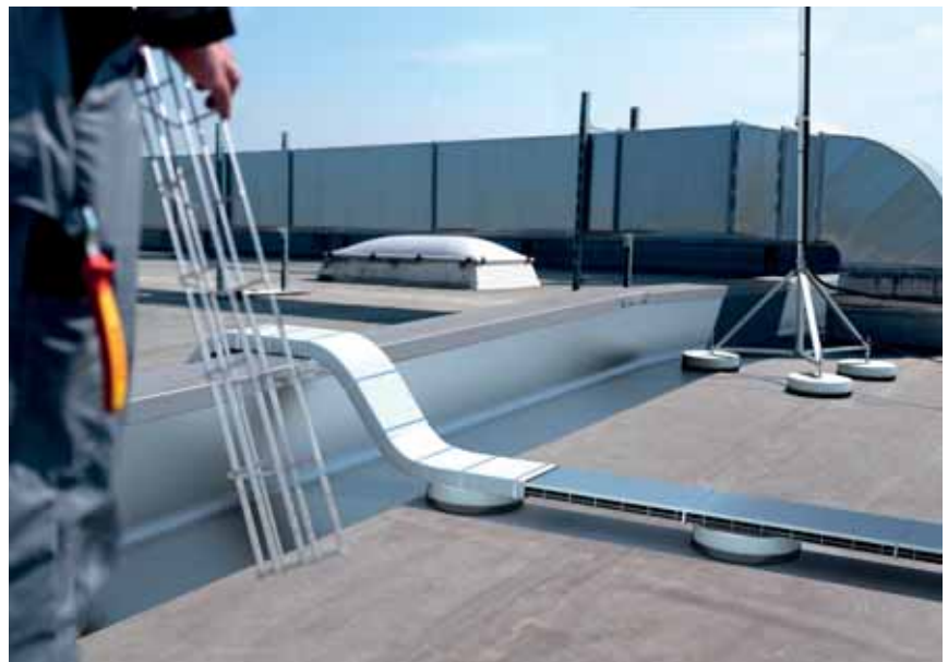
Top: labelled insulation system

OBO insulation maintains the integrity of fire areas, which prevents fire and smoke from spreading quickly. This insulation is designed for a variety of wall types and for the various pipes and cables that pass through them.