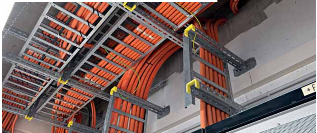
Function maintenance systems